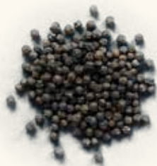
Tellicherry Black Pepper