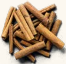
Cassia Cinnamon Bark